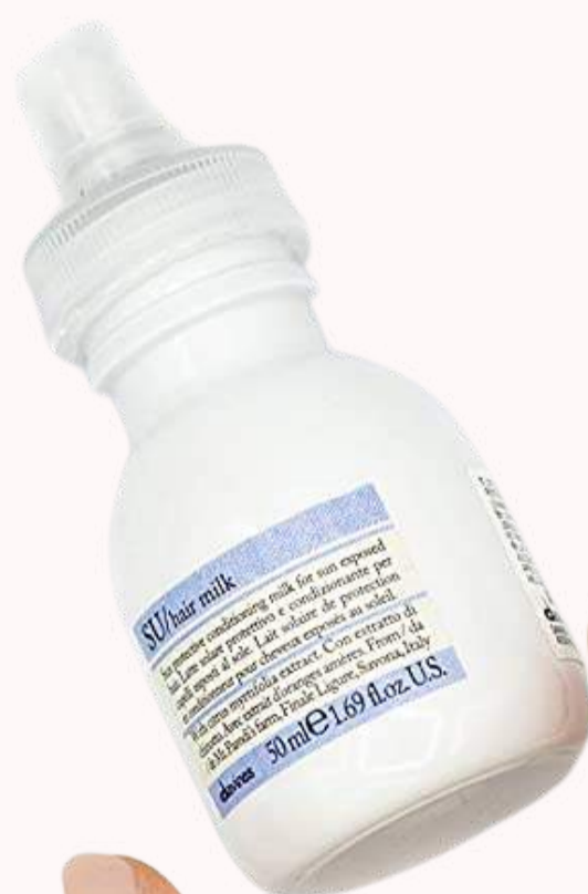
Oi Solu hair sunscreen and protector